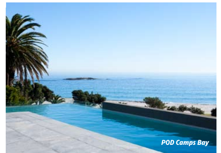
POD Camps Bay

TATLER READER OFFER Travel to South Africa for just £2,890 per person sharing, with four nights at Taj Cape Town on a bed-and-breakfast basis, two nights at Bushmans Kloof on a full-board basis, two nights at La Residence on a bed-and-breakfast, two nights at Birkenhead House on a full-board basis and two nights at POD Camps Bay on a bed-and-breakfast basis. Includes return British Airways economy class flights and 13 days car hire (Group B with super cover insurance and unlimited mileage). For more information, please call 0845 450 1533 or visit africatravel.co.uk